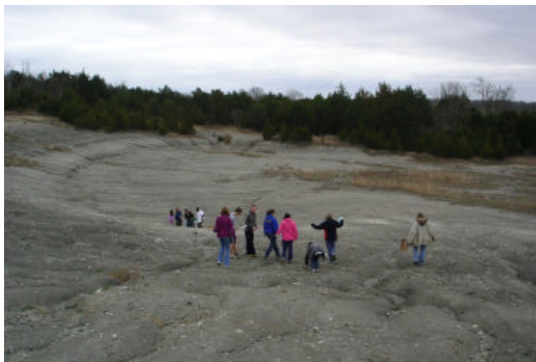
Broad View of The Birmingham Ridge Lime Quarry (Showing the Science Club Members)