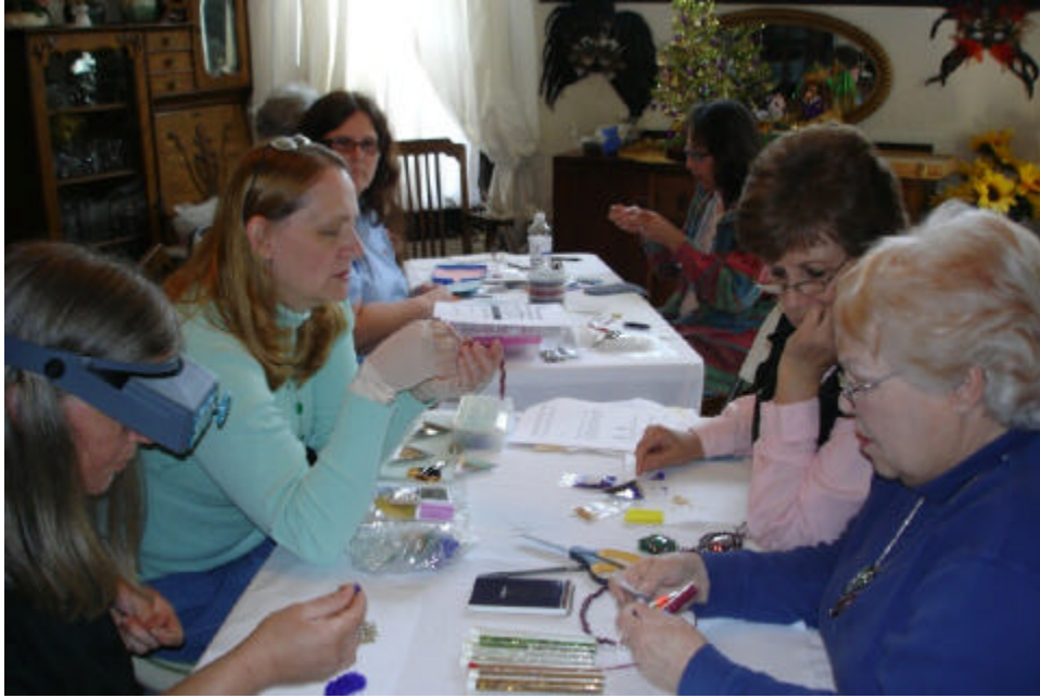
The whole beading workshop.